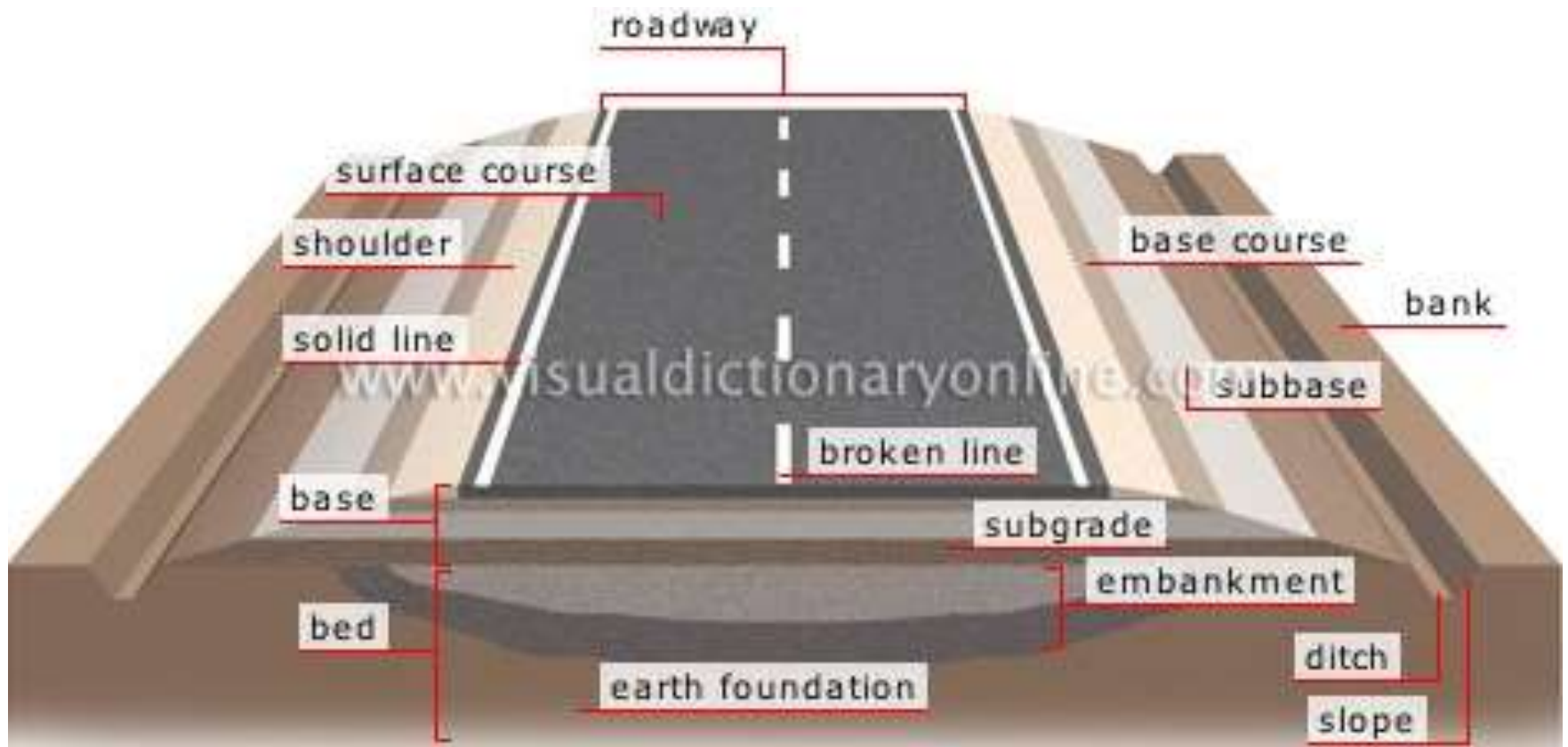
Cross Section of Roadway, Base, and Subgrade